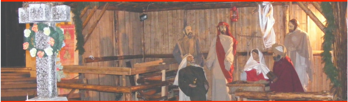
MERRY CHRISTMAS FROM THE LOUK FAMILY